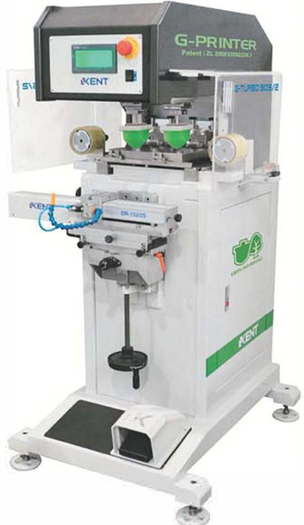
PLC control touch screen panel